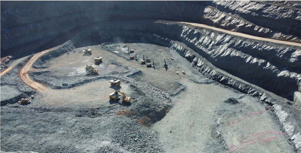
Figure 2 - Missouri Open Pit