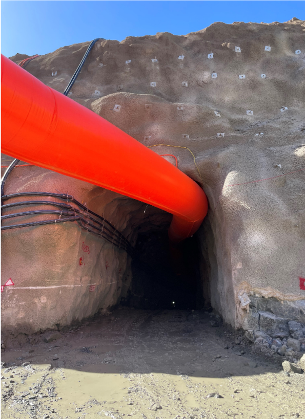
Figure 4 - Riverina Portal (left) and Riverina Decline (right)

A 15.5km pipeline was constructed as part of the integrated dewatering strategy for the existing open pit and underground operations. Primary fans have been purchased, with installation planned next quarter. The primary power station will also be installed next quarter to facilitate the mine expansion.