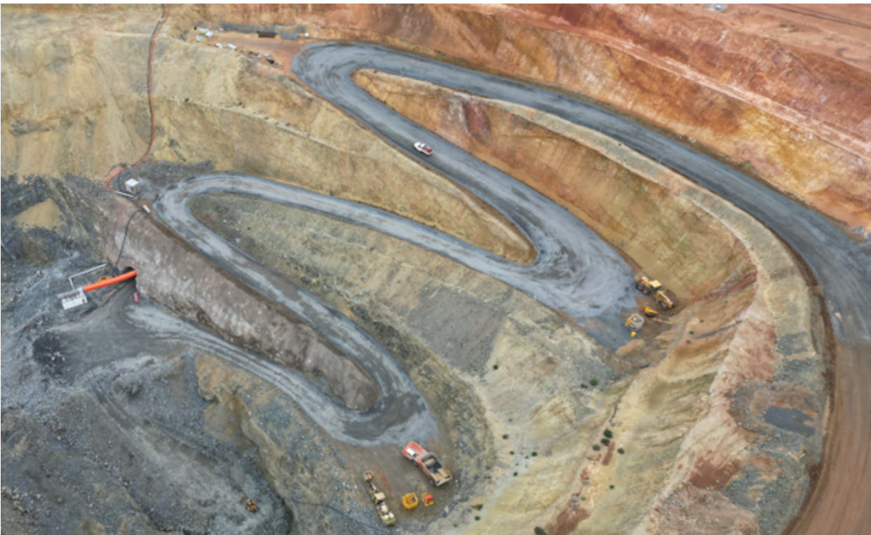
Figure 3 - View of Riverina Portal and access ramp

Development of the Riverina Underground commenced during the quarter. The Riverina portal was established in mid-May and mining has progressed in line with forecasts with total development of 265 metres completed in the six weeks since commencement with 254 metres of this development completed in the declines.